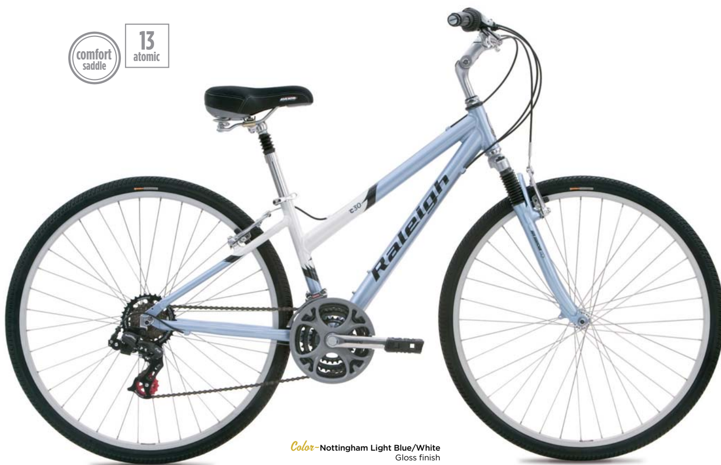
Color-Nottingham Light Blue/White Gloss finish

Frame: Atomic 13 Aluminum, Fork: RST 781CL, 50mm Travel Crankset: Shimano FC-TY33 28/38/48t, Front Derailleur: Shimano FD-TY32 Rear Derailleur: Shimano RD-TX-30, Shifter: Shimano REVO RS-31 Cassette: Shimano 7spd TZ-37 (14-34t), Seat Post: Alloy 27.2mm Suspension Saddle: Avenir Comfort 2-Density Base