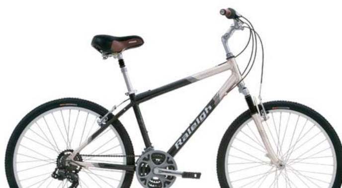
Color-Regal Black/Champagne wwwwwwGloss finish