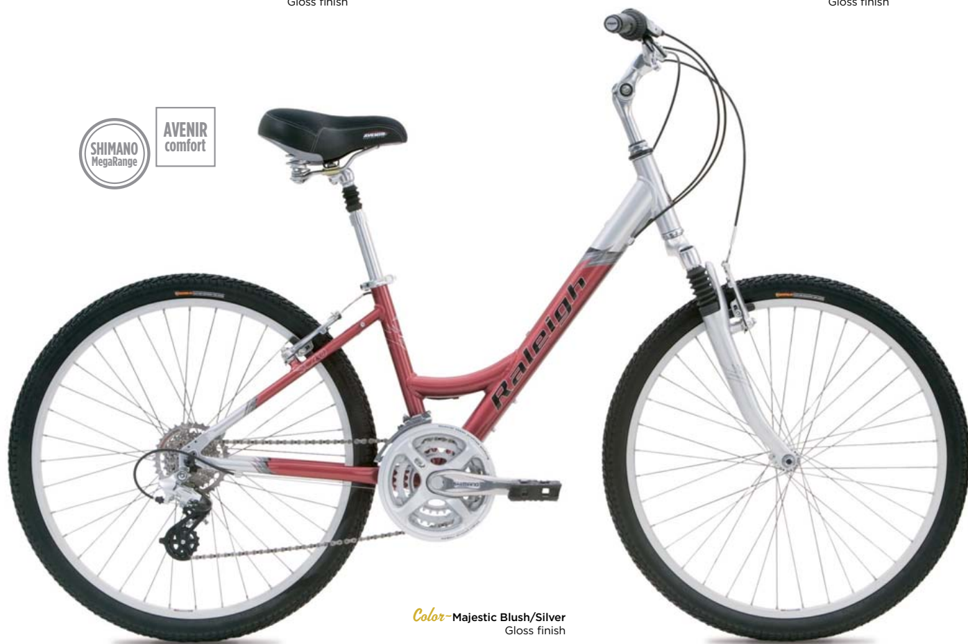
Color- Majestic Blush/Silver Gloss finish

Frame: Atomic 13 Aluminum, Fork: SR CR870 50mm Travel Crankset: Shimano FC-TX71 28/38/48t, Front Derailleur: Shimano FD-C202 Rear Derailleur: Shimano Acera RD-M340, Shifter: Shimano REVO RS-41 Cassette: Shimano 8spd HG40 (11-34t), Seat Post: Alloy Micro Adjust Suspension 27.2mm Saddle: Avenir Comfort w/Web Spring Base