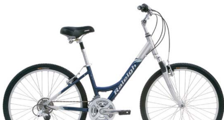
Color- Majestic Silver/Blue Gloss finish