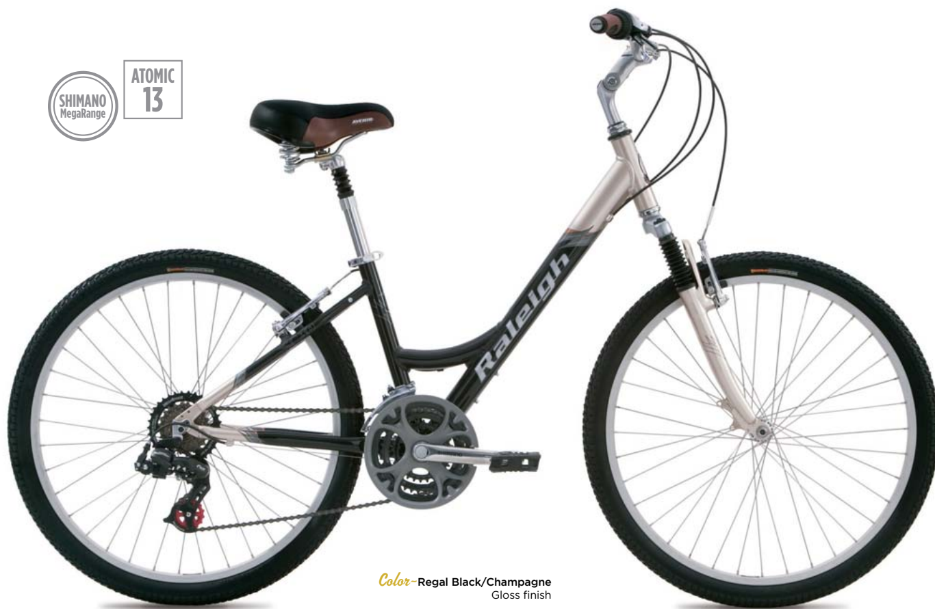
Color-Regal Black/Champagne Gloss finish

Frame: Atomic 13 Aluminum, Fork: RST 781CL, 50mm Travel Crankset: Shimano FC-TY33 28/38/48t, Front Derailleur: Shimano FD-CO50 Rear Derailleur: Shimano RD-TX-50, Shifter: Shimano REVO RS-41 Cassette: Shimano 7spd TZ-37 (14-34t), Seat Post: Alloy 27.2mm Suspension Saddle: Avenir Comfort