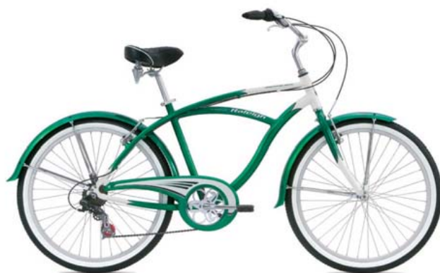
Color- Dover White/Green Gloss finish