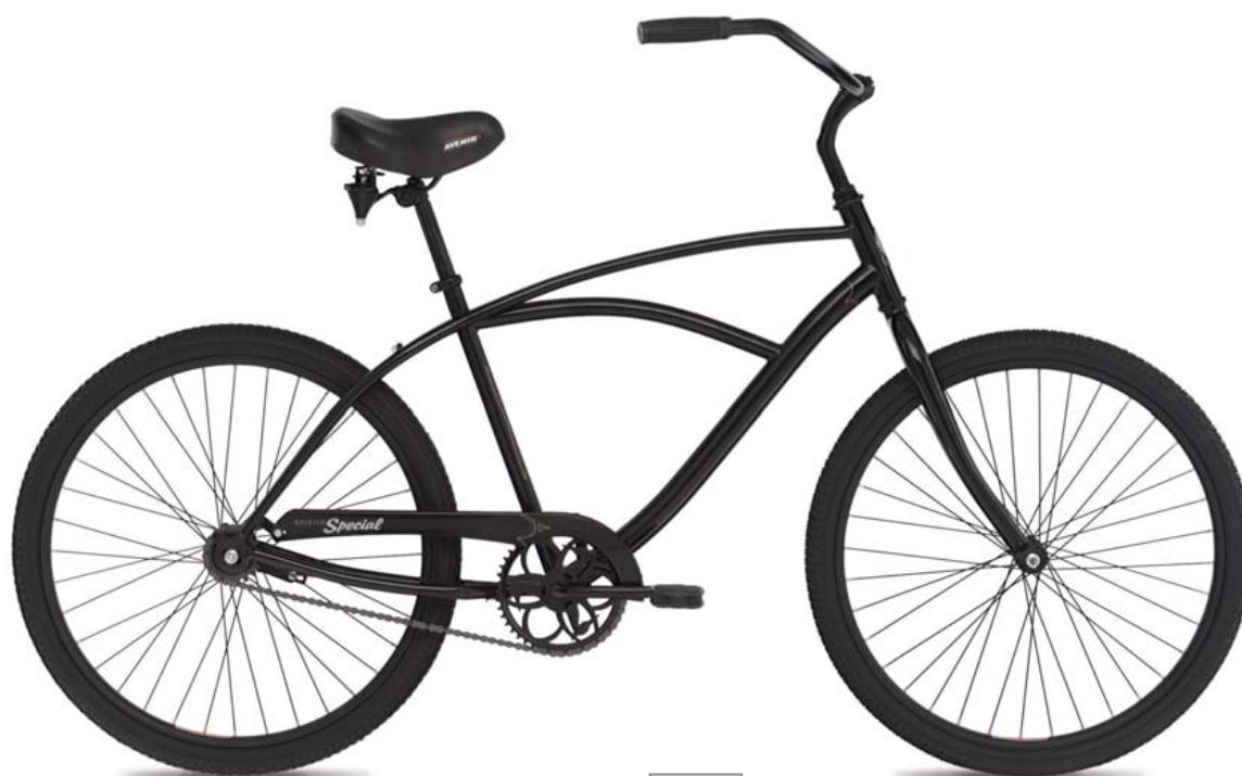
Color-Black Gloss finish

Available in men's 18" size in Black Gloss and women's 16" size in Blue Gloss finish.