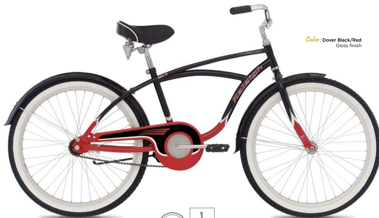
Color-Dover Black/Red Gloss finish

Available in Boy's 24" wheel in Dover Black/Red Gloss and Girl's 24" wheel in Dover White/Pink finishes.