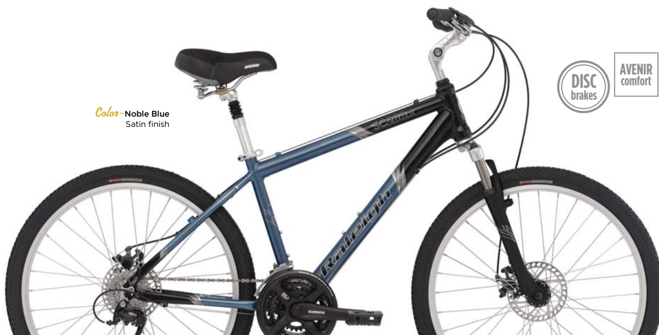
Color —Noble Blue Satin finish