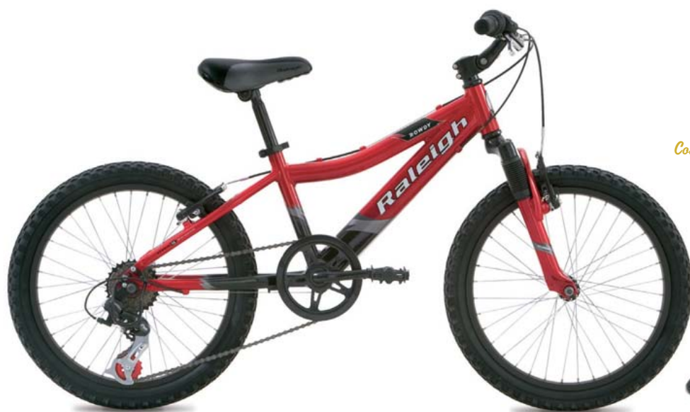
Color-Double Decker Red Gloss finish

Available in Boy's 20" wheel in Double Decker Red Gloss and Girl's 20" wheel in Fee-Fi-Fo-Plum Gloss finishes.