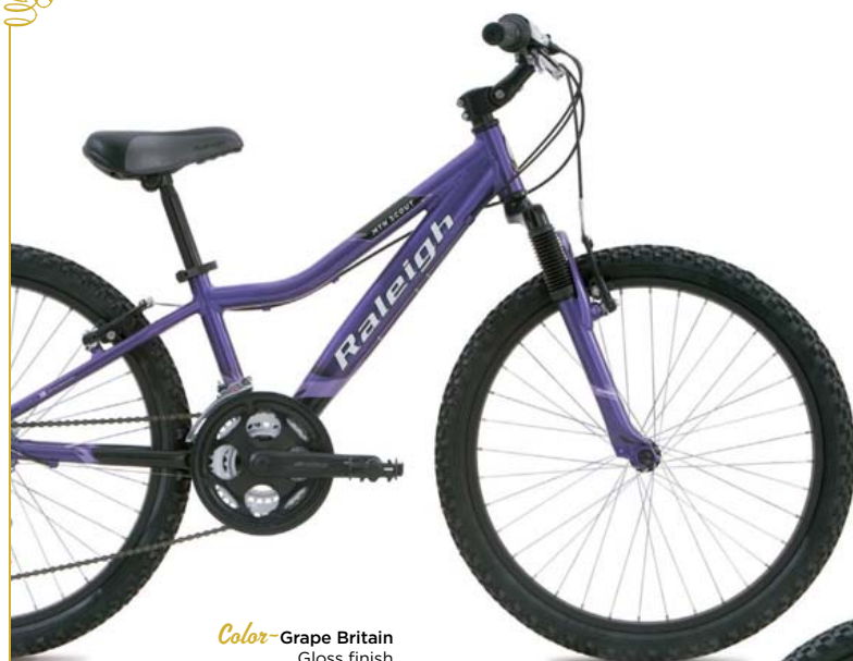
Color -Grape Britain Gloss finish

Available in Boy's 24" wheel in Silver Knight/Black Gloss and Girl's 24" wheel in Grape Britain/Black Gloss finishes.