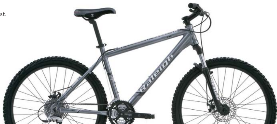
Color-London Silver Gloss finish

Frame: Atomic 13 SL Butted Aluminum Fork: Manitou Six 80mm w/Preload Adjust. Headset: WTB Zero Stack Crankset: Truvativ Blaze 22/32/44t Front Derailleur: Shimano Deore FD-510 Rear Derailleur: Shimano LX RD-M570S Shifter: Shimano Deore M510 Cassette: 9spd SRAM PG-950 (11-34t) Brakes: Hayes HMX-2