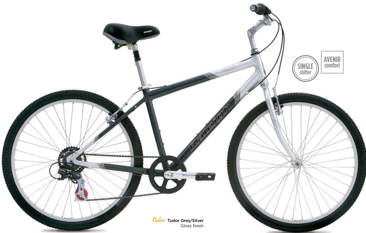
Color—Tudor Grey/Silver Gloss finish

Available in men's 16", 18", 20" and 22" sizes and women's 16" and 19" sizes in Tudor Grey/Silver Gloss or Tudor Blue/Silver Gloss finishes.