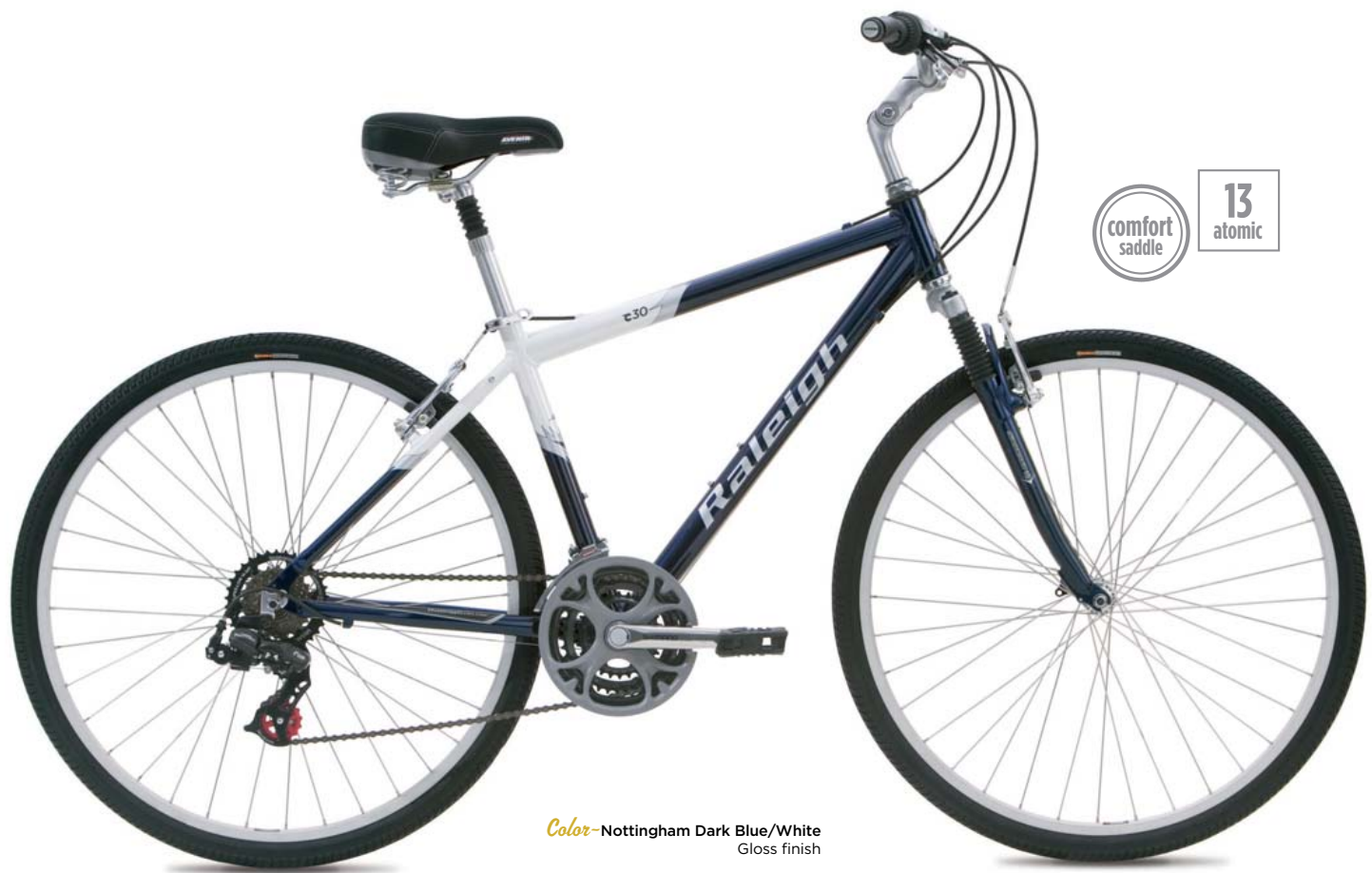
Color-Nottingham Dark Blue/White Gloss finish

Available in men's 15", 17", 19", 21" and 23" sizes in Nottingham Dark Blue/White Gloss or Nottingham Silver/Grey and women's 16" and 19" sizes in Nottingham Light Blue/White Gloss or Nottingham Silver/Green finishes.