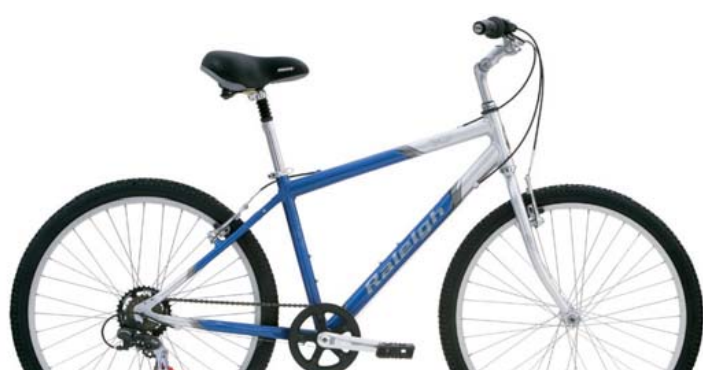
Color-Tudor Blue/Silver Gloss finish