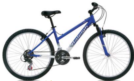
Color-British Blue/White Gloss finish