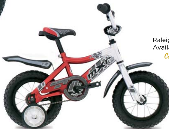
Raleigh: MXR micro Available in Boy's 12" wheel.