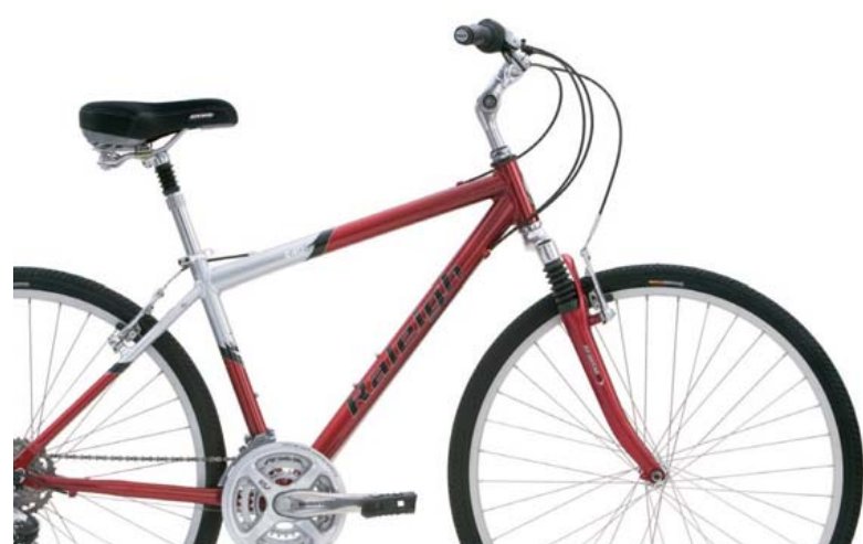
Color-English Red/Silver Gloss finish

Available in men's 15", 17", 19", 21" and 23" sizes in English Red/Silver or English Green/White Gloss and women's 16" and 19" sizes in English Lavendar or English Green/White Gloss finishes.