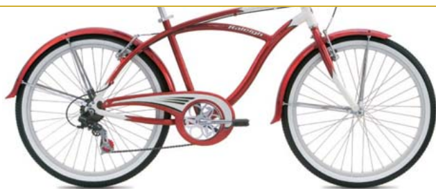
Color- Dover White/Red Gloss finish

Available in men's 18" and women's 16" sizes in Dover White/Red Gloss or Dover White/Green Gloss finishes.