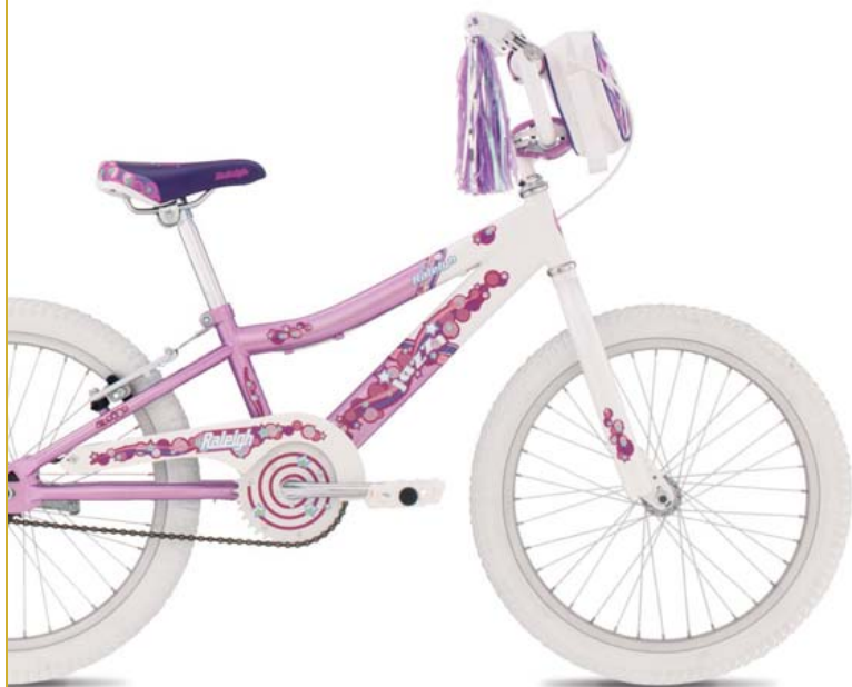
Raleigh: Jazzi Available in Girl's 20" wheel. Color -Pearl White/Sugarplum Gloss finish

Raleigh Girls Youth bikes for 2005 have plenty of style and durability for the softer side of your brood. We've even accessorized with nice touches such as handlebar streamers and a matching handbag. They're sure to be a hit in the neighborhood style parade.