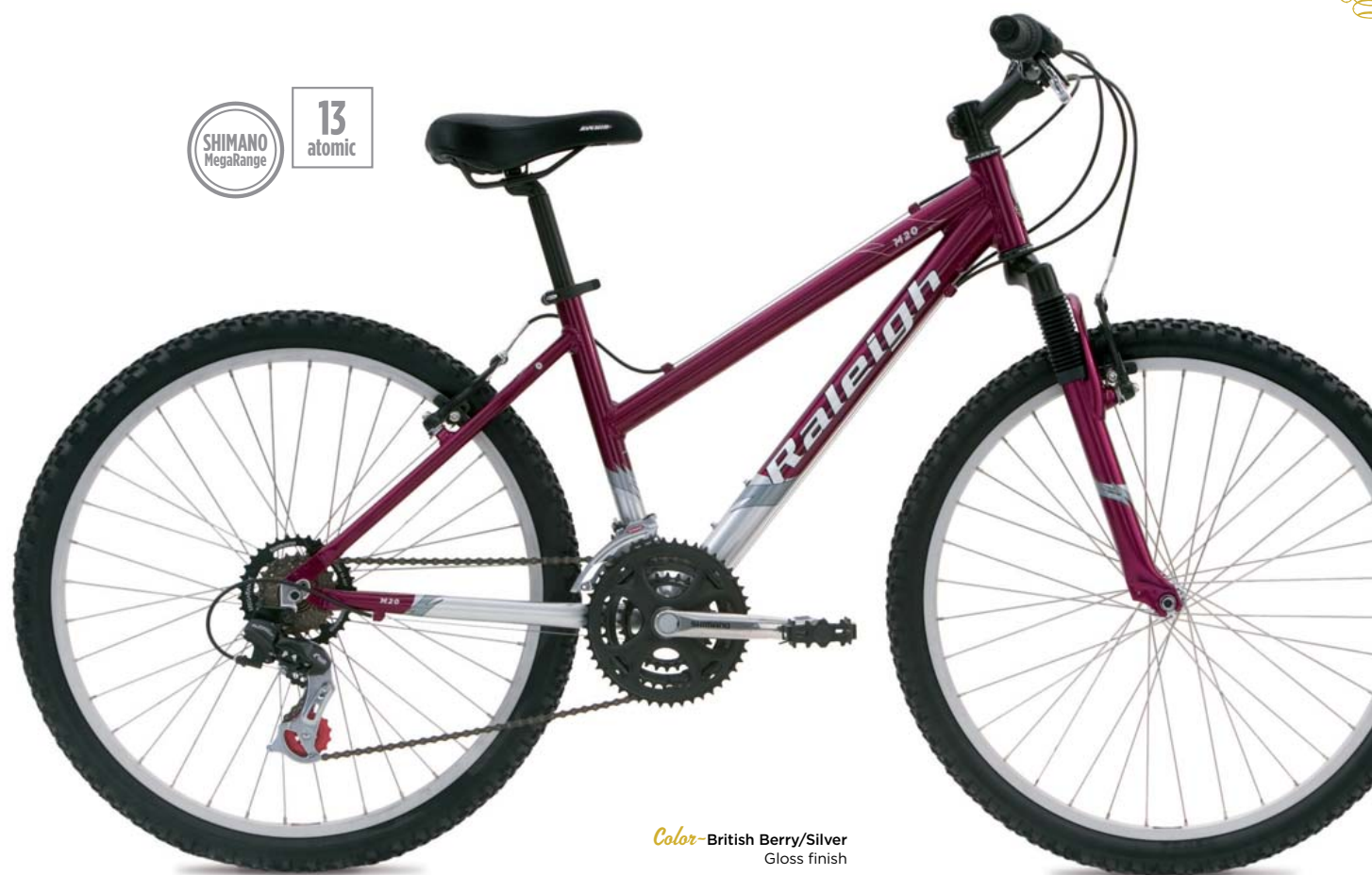
Color-British Berry/Silver Gloss finish