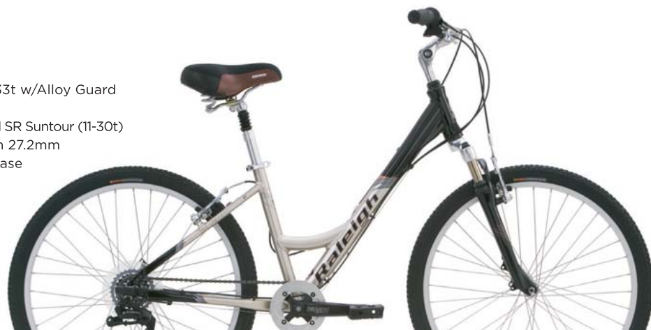
Color —Noble Champagne/Black Gloss finish

Frame: Atomic 13 SL Butted Aluminum Fork: SR NEX4000 63mm Travel Crankset: Truvativ ISO-Flow Dual Drive 33t w/Alloy Guard Rear Derailleur: SRAM Dual Drive 7 Shifter: SRAM Dual Drive, Cassette: 7spd SR Suntour (11-30t) Seat Post: Alloy Micro Adjust Suspension 27.2mm Saddle: Avenir Comfort w/Web Spring Base