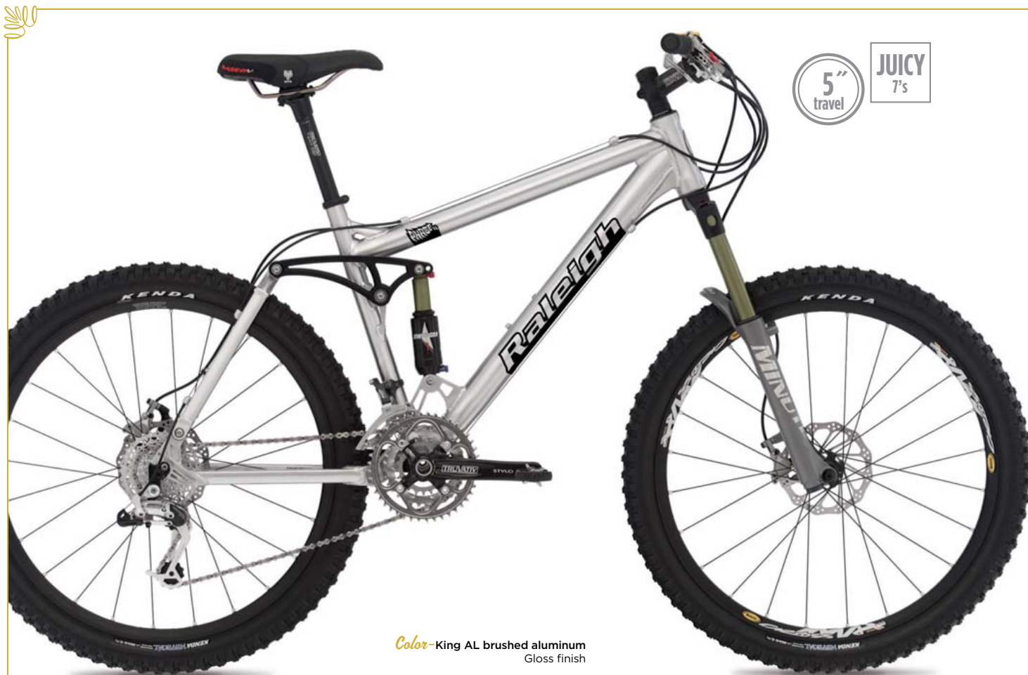
Color-King AL brushed aluminum Gloss finish

Available in small, medium, and large sizes in King AL brushed aluminum Gloss finish.