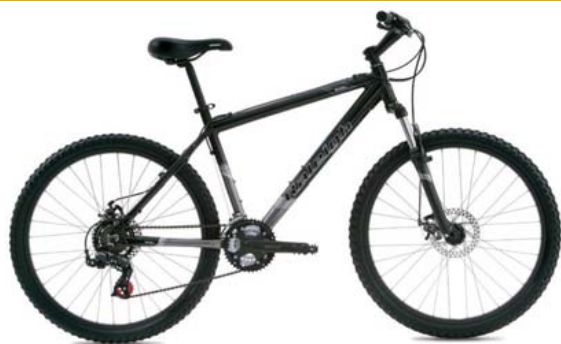
Color -Saxon Black/Silver Gloss finish