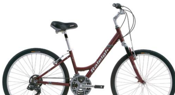
Color-Regal Red Gloss finish