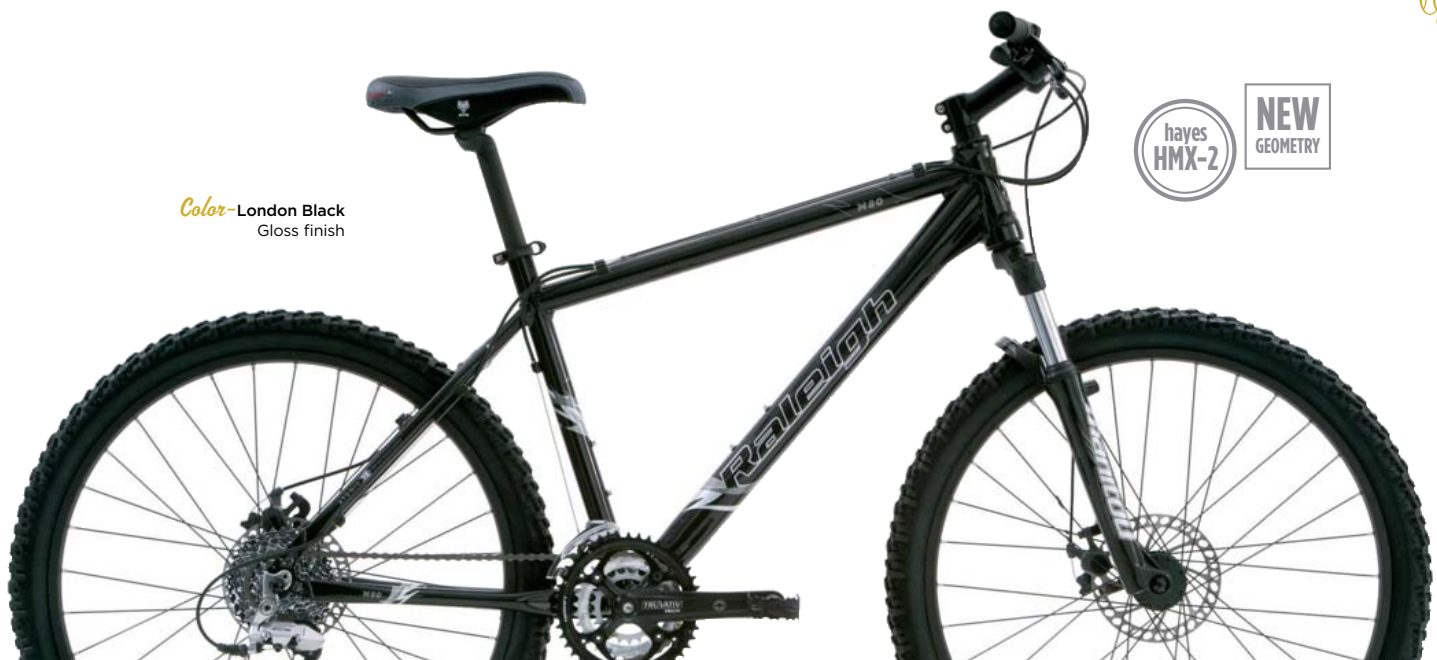
Color-London Black Gloss finish

Available in 14", 16", 18", 20" and 22" sizes in London Black Gloss or London Silver Gloss finish.