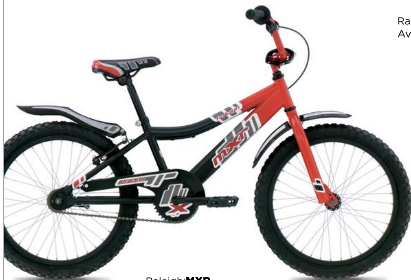
Raleigh: MXR Available in Boy's 20" wheel.

Aggressive looks and durable parts are sure to please the tastes and stand up to the rigors of your little rippers.