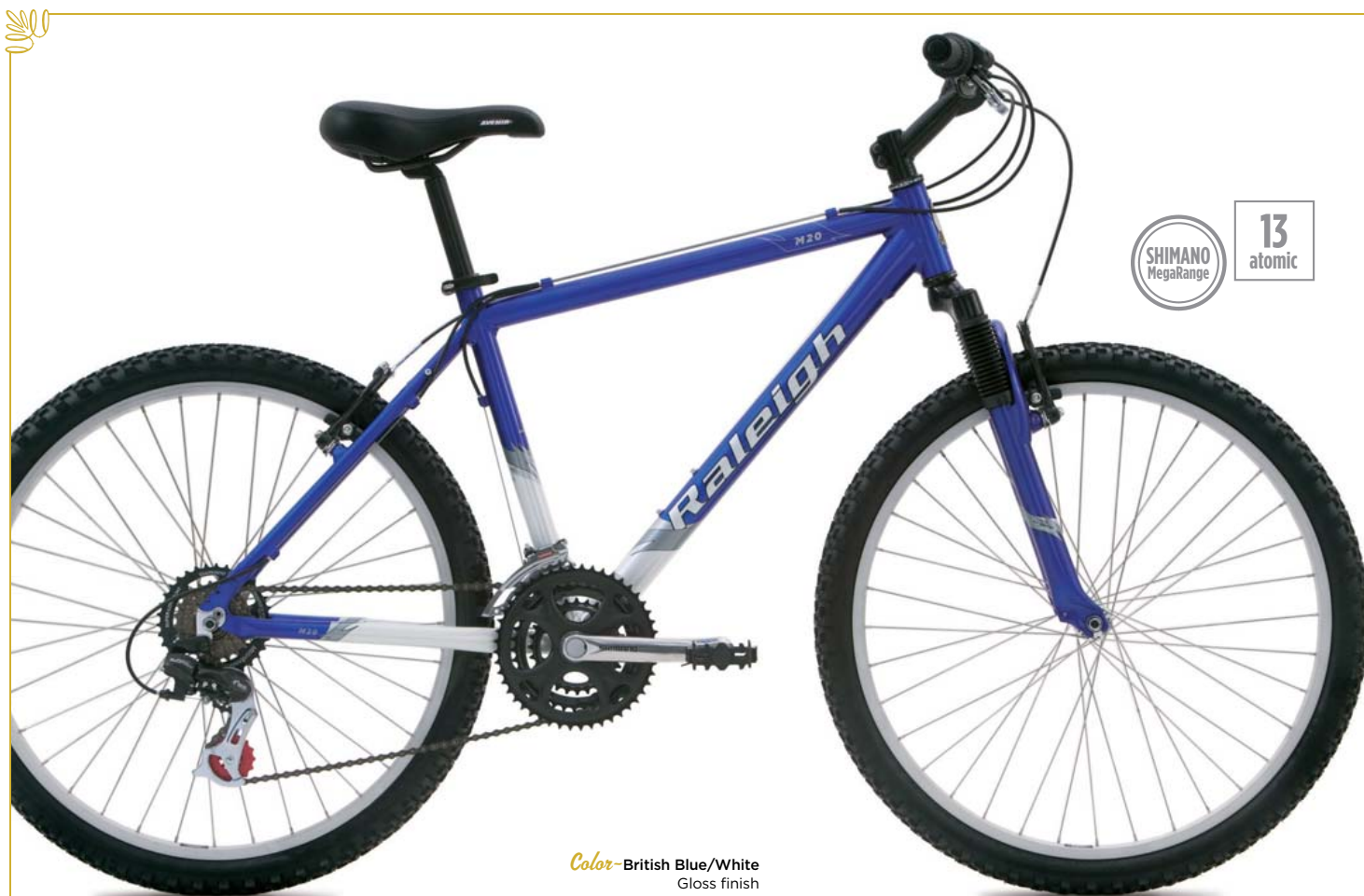
Color- British Blue/White Gloss finish

Available in men's 14", 16", 18", 20" and 22" sizes in British Black Satin or British Blue/White Gloss finishes. Women's sizes 12", 14" and 16" are available in British Berry/White Gloss or British Blue/Silver Gloss finishes.