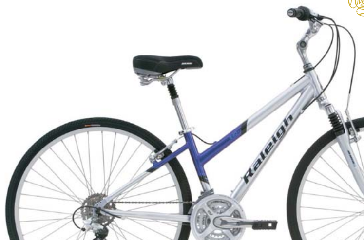
Color-English Lavendar/Silver Gloss finish