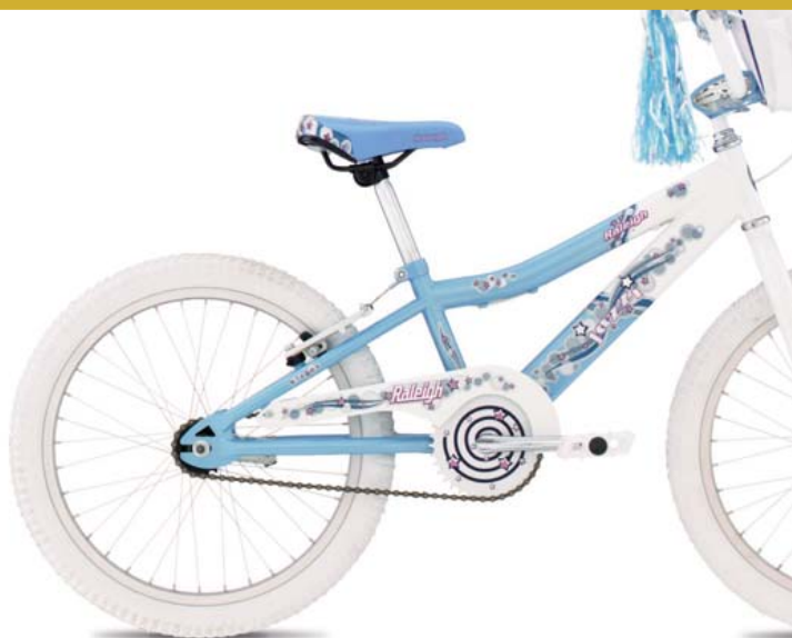
Raleigh: Jazzi Available in Girl's 20" wheel. Color -Pearl White/Blue Sherbet Gloss finish