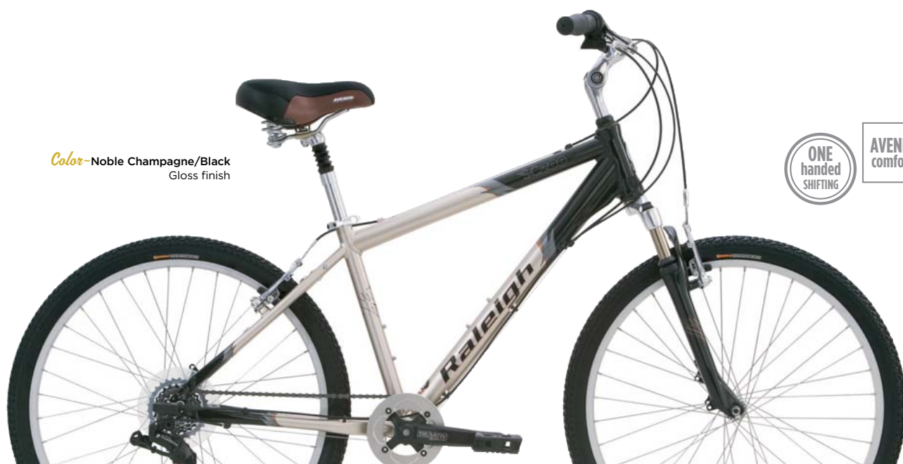
Color —Noble Champagne/Black Gloss finish

Available in men's 16", 18", 20" and 22" sizes and women's 17" in Noble Champagne/Black Gloss finish.