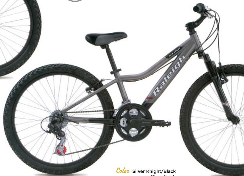
Color -Silver Knight/Black Gloss finish

Frame: 24" Aluminum OS Action Curve ATB, Fork: SR Suntour M2000, 40mm Travel Crankset: SR XC100 28/38/48t w/Chainguard, Front Derailleur: Shimano TY32 Rear Derailleur: Shimano TX30 7spd, Shifter: Shimano RS41 REVO Cassette: Sun Race HG72 7s 13-28t, Rims: Alloy 24" 36h Handlebars: ATB Jr. Riser 580 x 30mm