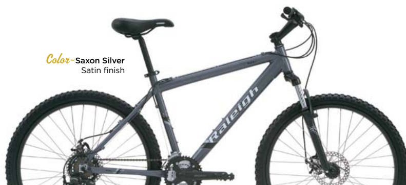
Color -Saxon Silver Satin finish