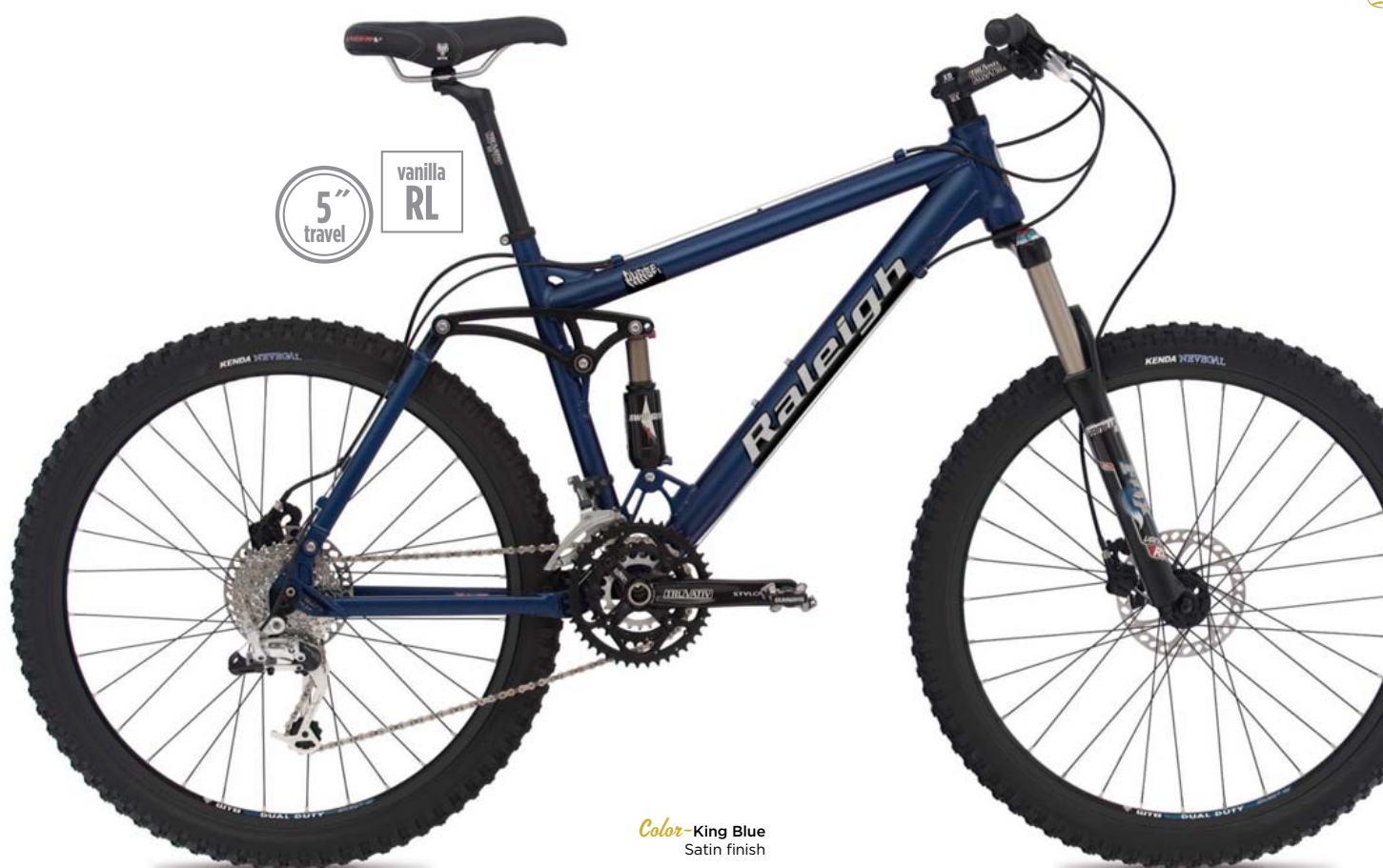
Color—King Blue Satin finish

Available in small, medium, and large sizes in King Blue Satin finish.