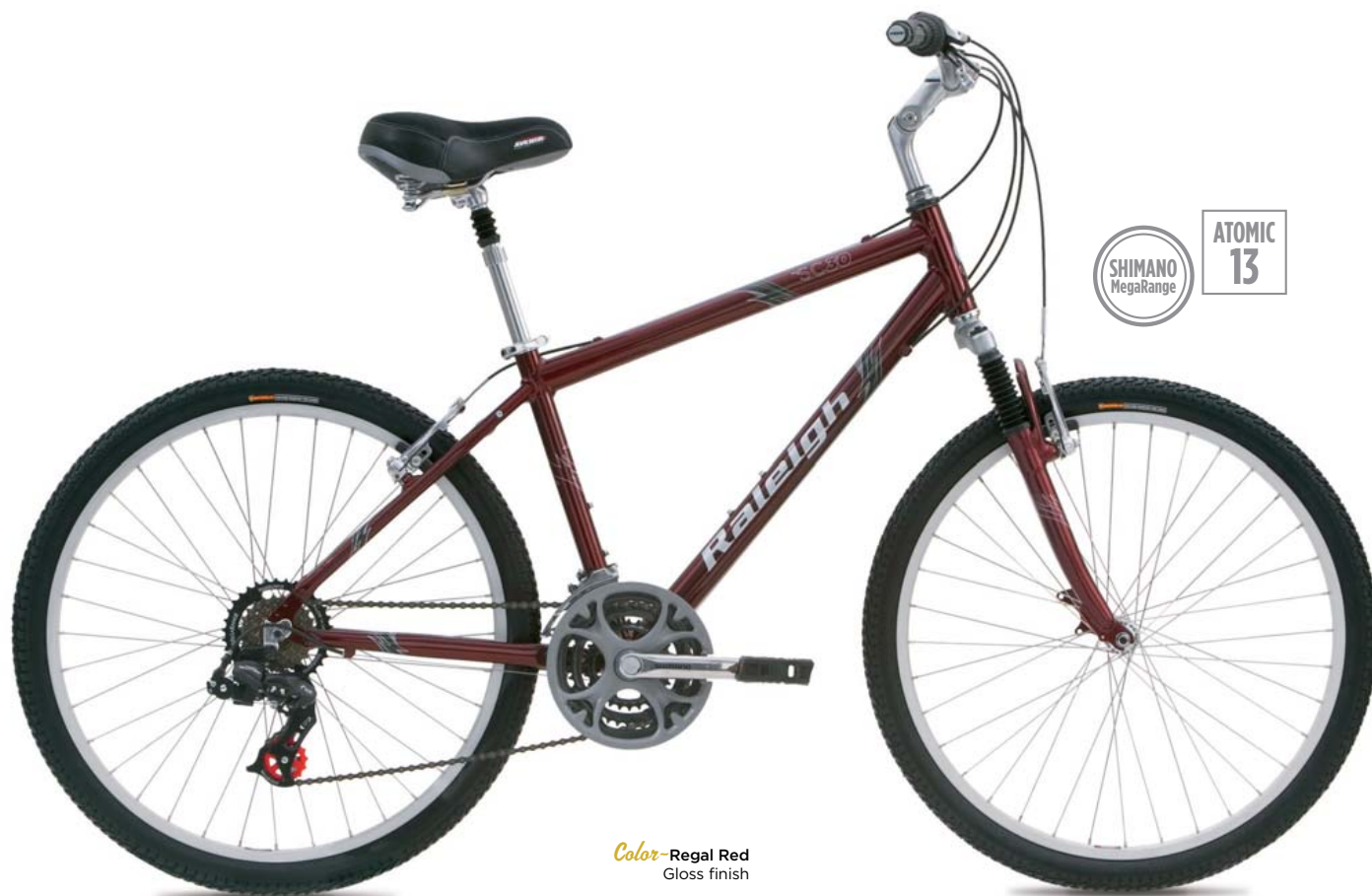
Color—Regal Red Gloss finish

Available in men's 14", 16", 18", 20" and 22" sizes and women's 16" and 19" sizes in Regal Red Gloss or Regal Black/Champagne Gloss finish (with custom color grips and saddles).