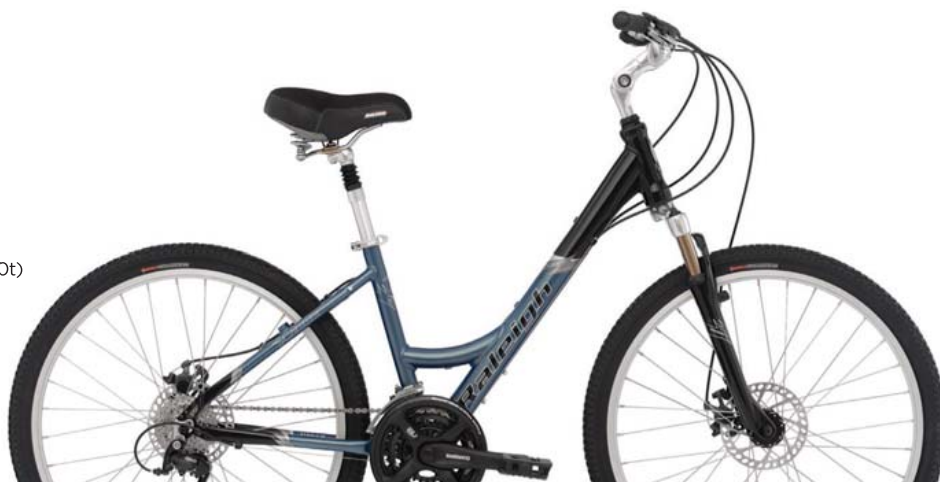
Color —Noble Blue Satin finish

Frame: Atomic 13 SL Butted Aluminum Fork: SR NEX4000 63mm Travel Crankset: Shimano FC-TX71 28/38/48t Bottom Bracket: Sealed Cartridge Front Derailleur: Shimano FD-C202 Rear Derailleur: Shimano Alivio RD-M20 Shifter: Shimano EF29 Cassette: Shimano 8spd SRAM PG-850 (11-30t) Seat Post: Alloy Micro Adjust Suspension Saddle: Avenir Comfort w/Web Spring