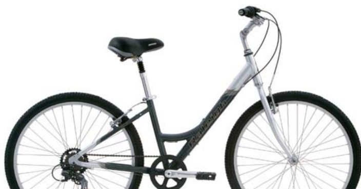
Color-Tudor Grey/Silver Gloss finish