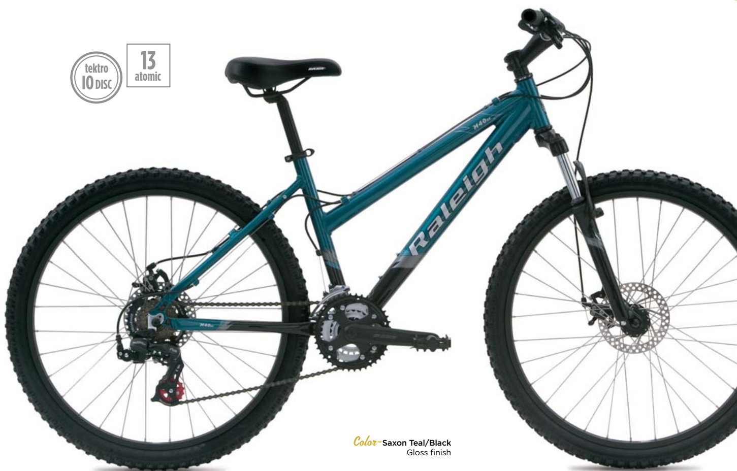
Color -Saxon Teal/Black Gloss finish