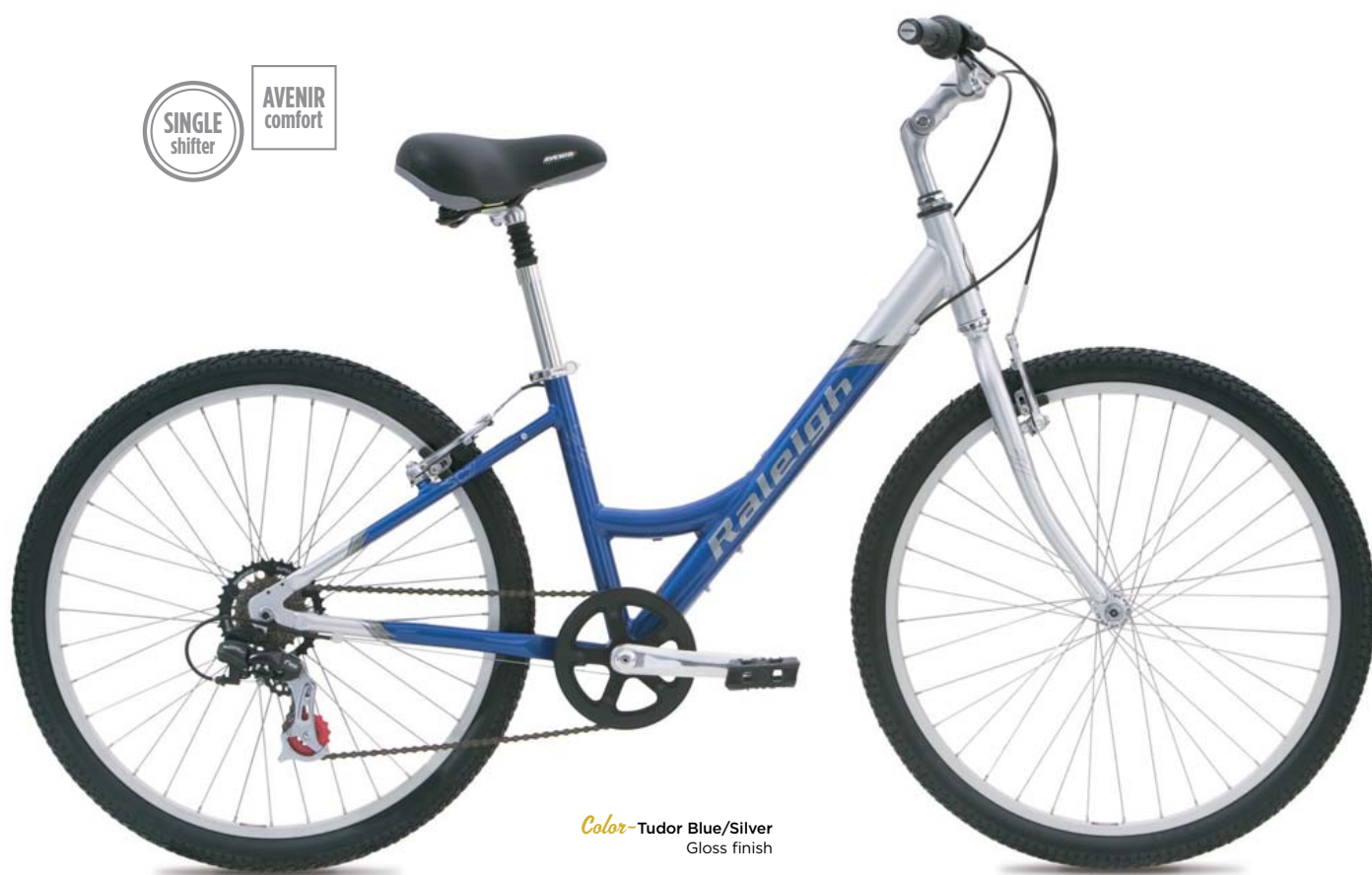
Color-Tudor Blue/Silver Gloss finish

Frame: Atomic 13 Aluminum, Fork: OS Steel Threaded Crankset: Pro Wheel 40t, Rear Derailleur: Shimano RD-TX-30 Shifter: Shimano REVO RS-31, Cassette: Shimano 7spd TZ-37 (14-34t) Seat Post: Alloy 27.2mm Suspension, Saddle: Avenir Comfort