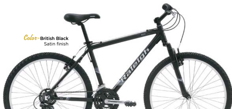
Color-British Black Satin finish