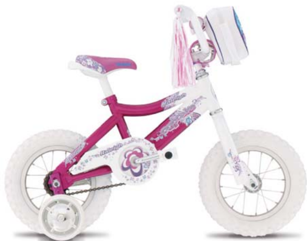
Raleigh: Cupcake Available in Girl's 12" wheel. Color -Pink Frosting/White Gloss finish