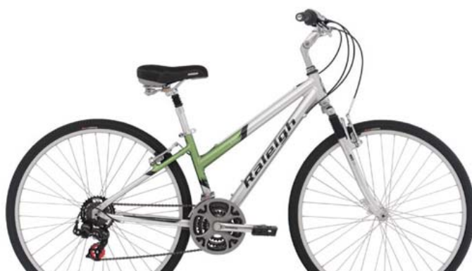
Color-Nottingham Silver/Green Gloss finish