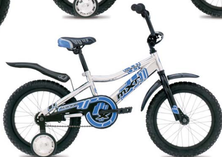
Raleigh: MXR mini Available in Boy's 20" wheel.