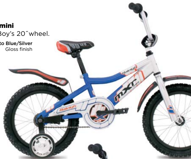
Raleigh: MXR mini Available in Boy's 20" wheel.