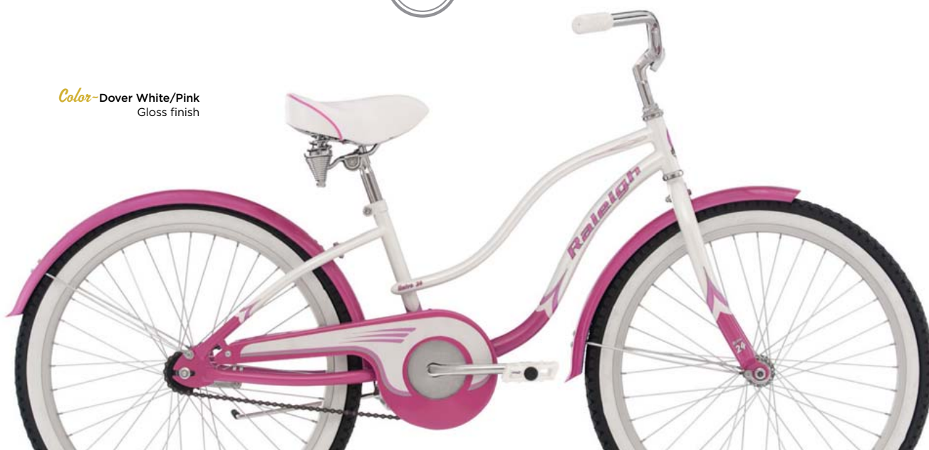
Color-Dover White/Pink Gloss finish