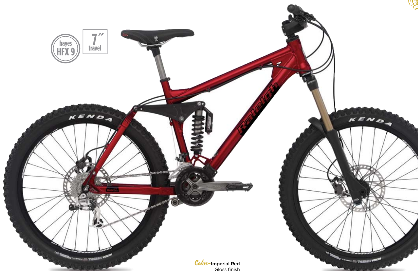
Color-Imperial Red Gloss finish

Available in small, medium, and large sizes in Imperial Red Gloss finish.