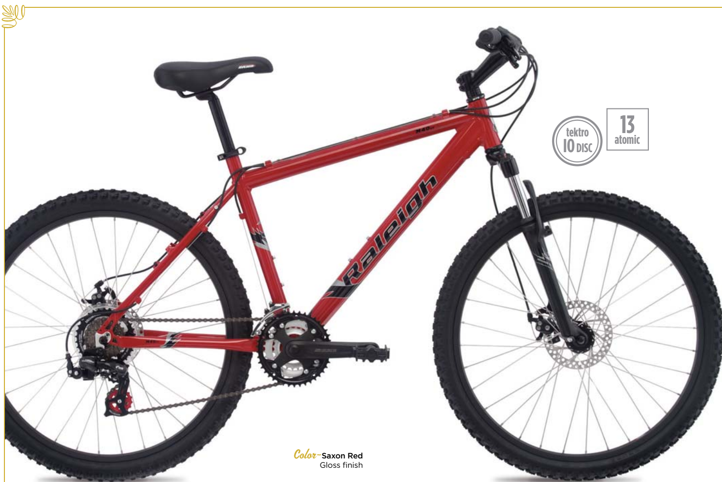
Color- Saxon Red Gloss finish

Available in men's 14", 16", 18", 20" and 22" sizes in Saxon Red Gloss, Saxon Silver Satin or Saxon Black/Silver Gloss finishes. Women's size 16" is available in Saxon Teal/Black Gloss finish.