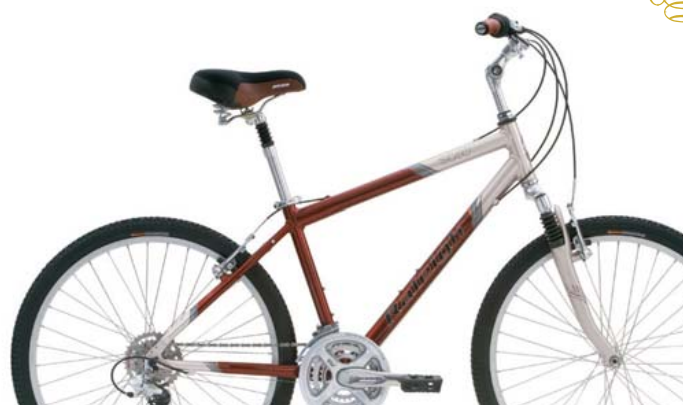
Color- Majestic Copper/Champagne Gloss finish