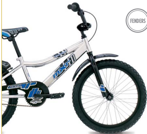
Raleigh: MXR Available in Boy's 20" wheel.