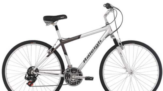
Color-Nottingham Silver/Grey Gloss finish