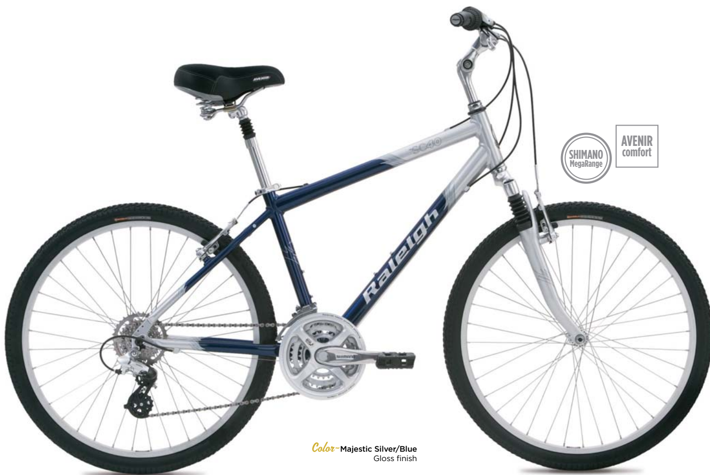
Color- Majestic Silver/Blue Gloss finish

Available in men's 14", 16", 18", 20" and 22" sizes in Majestic Copper/Champagne Gloss or Majestic Silver/Blue Gloss finishes, and women's 16" and 19" sizes in Majestic Silver/Blue Gloss or Majestic Blush/Silver Gloss finishes.